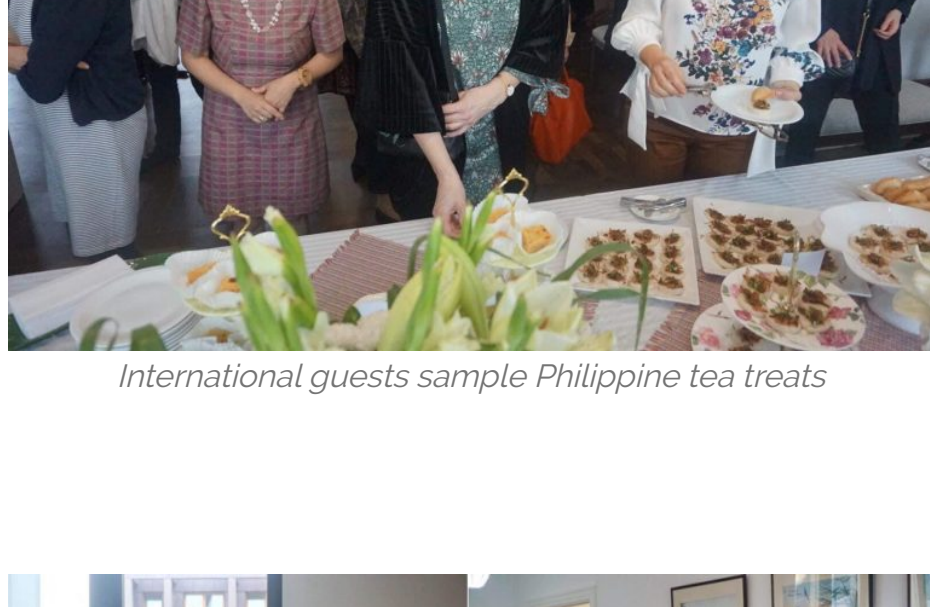
International guests sample Philippine tea treats