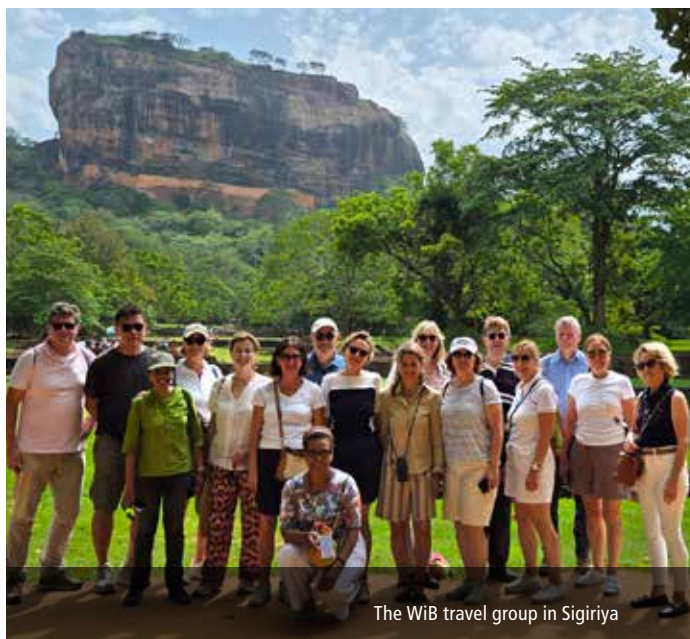
The WiB travel group in Sigiriya